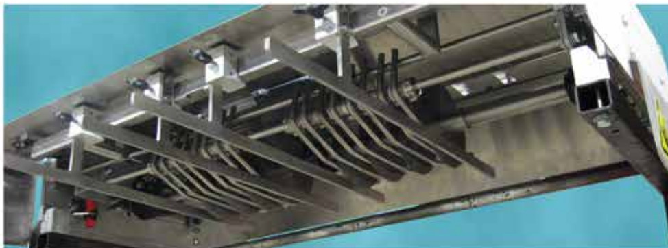
Blades are factory preset based on product requirements