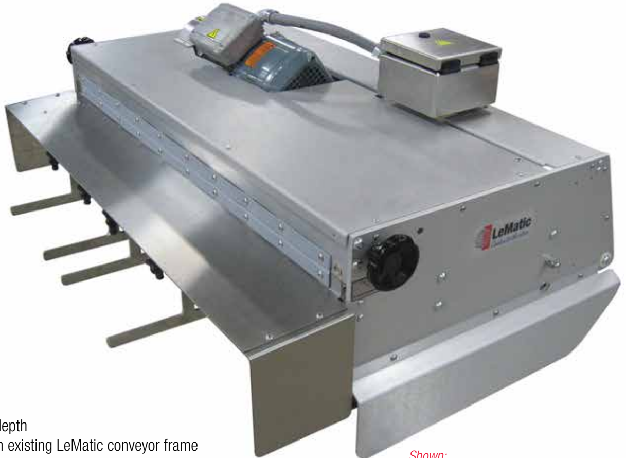
Shown: Model TS-8