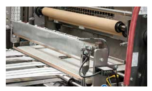
Seal bar design offers precise heat control and fast impulse sealing technology. Narrower transfer allows for running smaller product across the bar.